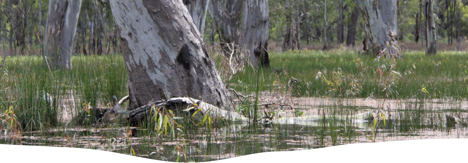
▲ River Red Gums at Doctor's Swamp, Murchison.