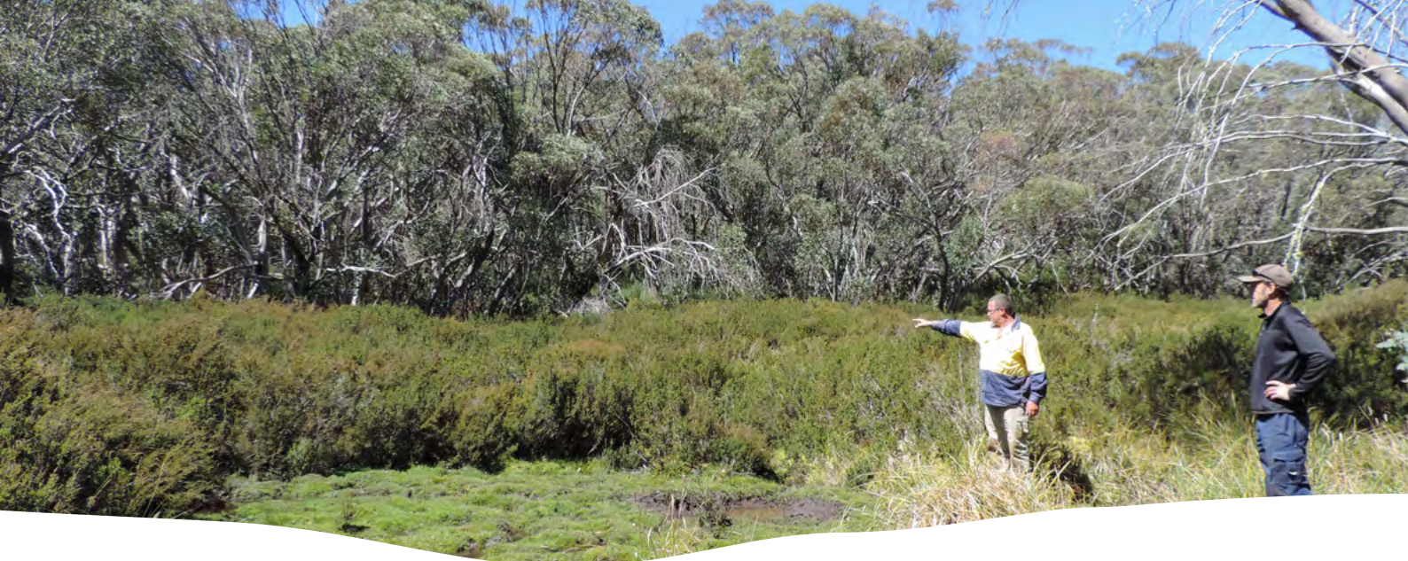
▲ Shane Monk (Taungurung) and Jim Begley (GB CMA) at a habitat site on Taungurung Country.