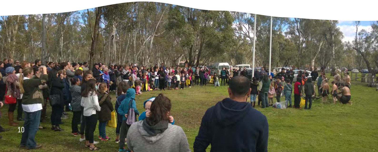
▼ Yorta Yorta people and local community attending NAIDOC Week event at Barmah National Park on Yorta Yorta Country.